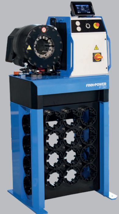
Tool rack with QuickChange-tool as an option.