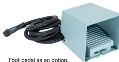
Foot pedal as an option.