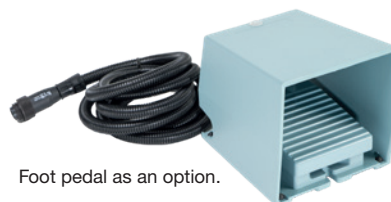
Foot pedal as an option.