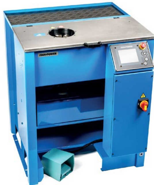
FINN-POWER NC60 CRIMPING MACHINE FOR SERIAL PRODUCTION

UC STRAIGHTFORWARD CRIMPING CONTROLLING.