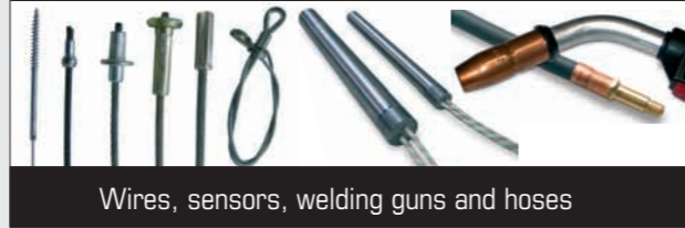
Wires, sensors, welding guns and hoses