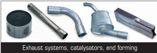
Exhaust systems, catalysators, end forming