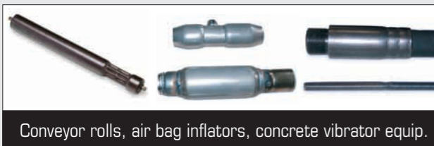
Conveyor rolls, air bag inflators, concrete vibrator equip.