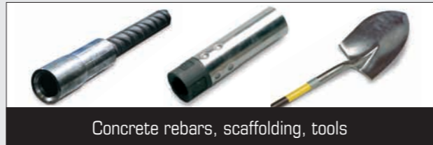
Concrete rebars, scaffolding, tools