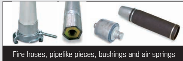
Fire hoses, pipelike pieces, bushings and air springs